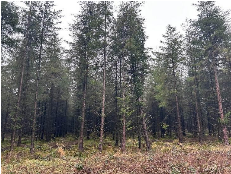
Plate 15-14 Location of substation, facing north