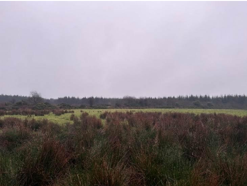
Plate 15-4 Site of Turbine 1, facing south-southeast