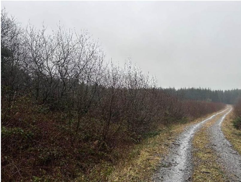
Plate 15-13 Turbine 4, facing east-northeast