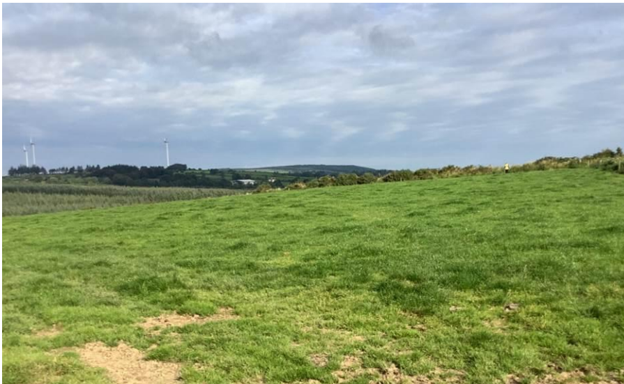
Plate 15-18 Turbine 6, facing west-northwest