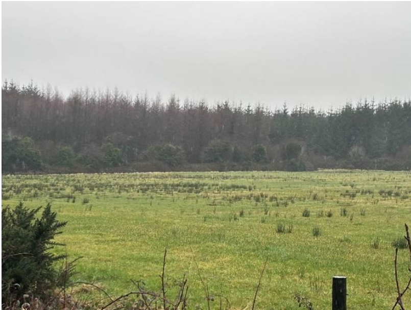
Plate 15-7 Turbine 10, facing northwest