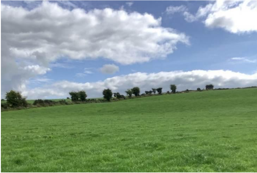
Plate 15-17 Turbine 5, facing north-northwest