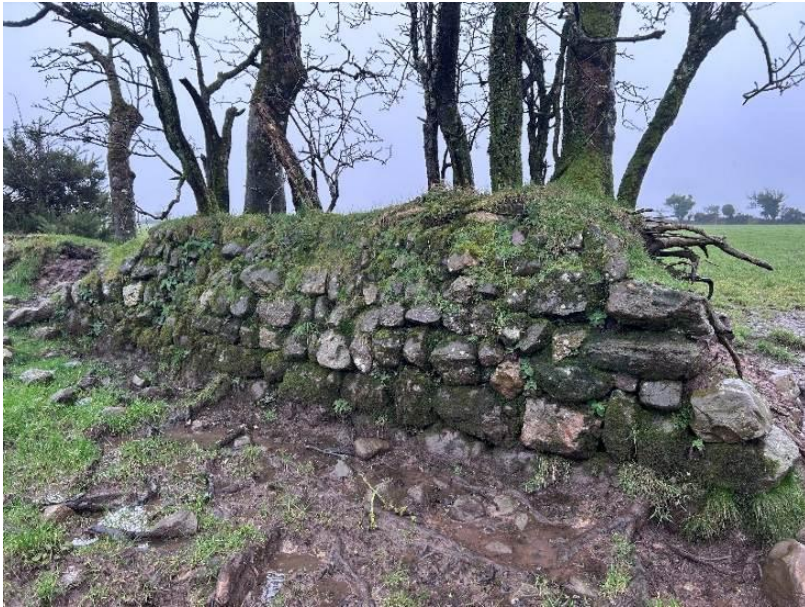
Plate 15-11 Denuded field boundary, facing southeast