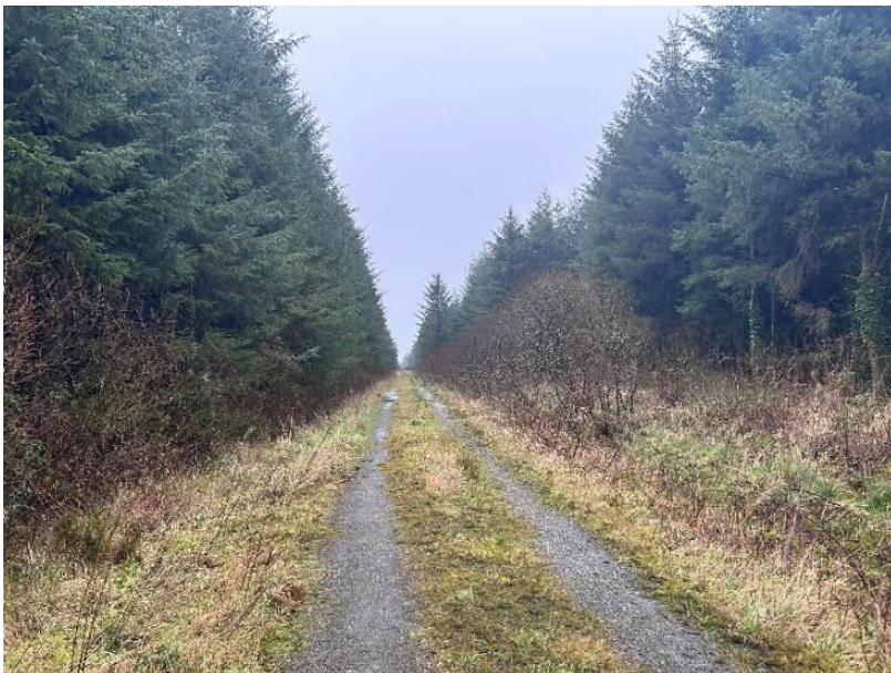
Plate 15-12 Existing forestry access to be utilized by the development, facing east