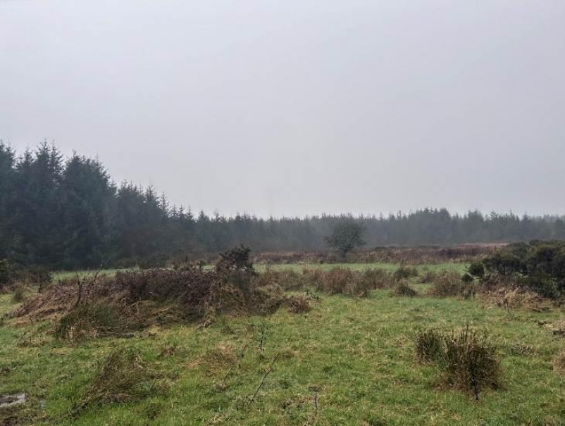
Plate 15-15 Turbine 3, facing north-northwest