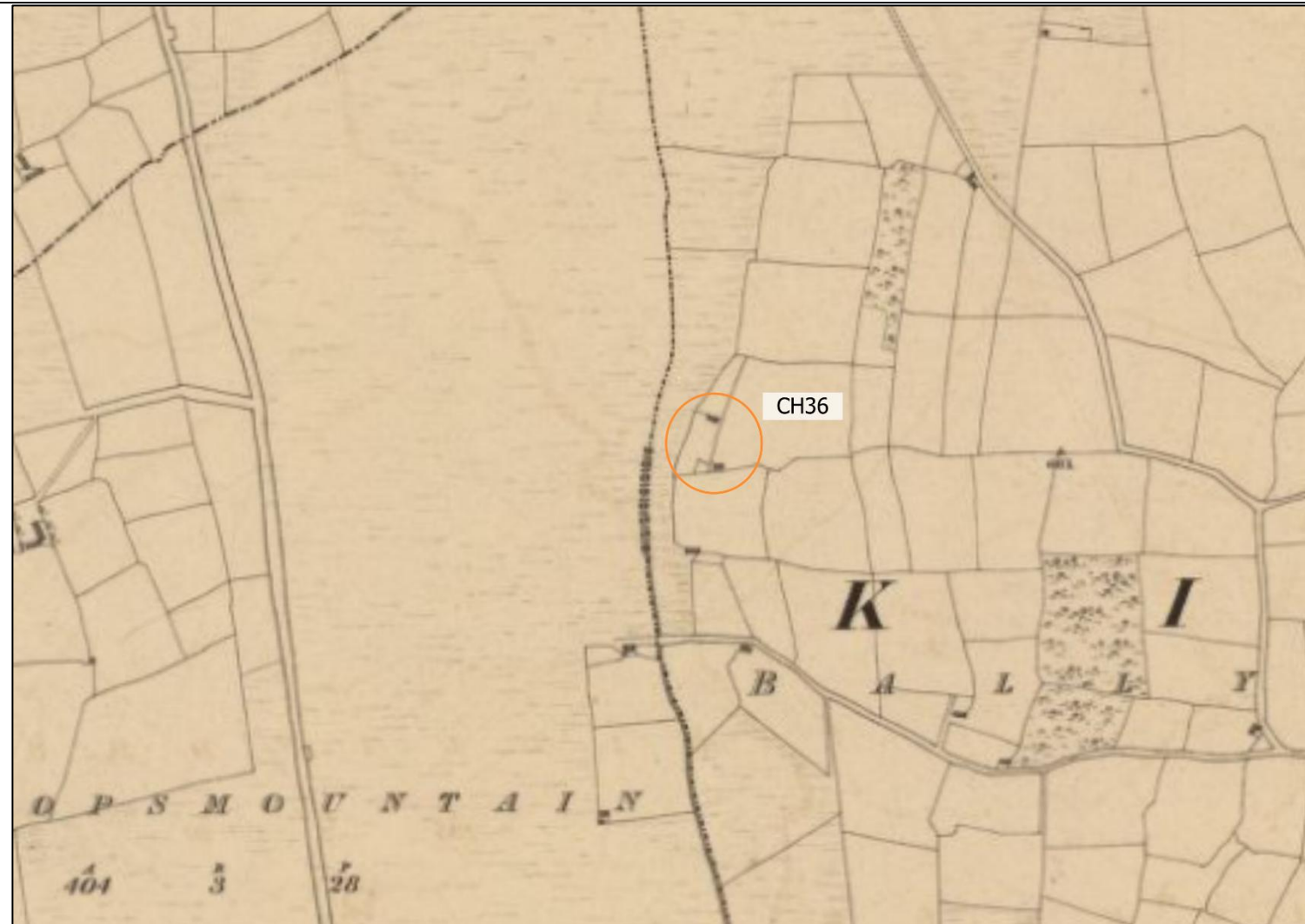
Plate 15-1: Extract from 1842 OS map, showing location of two buildings comprising CH36.