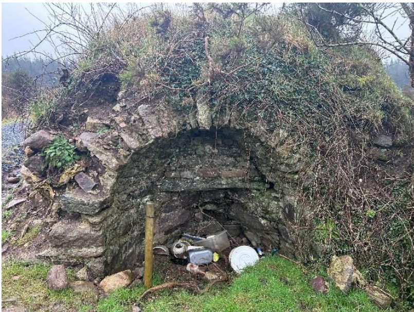
Plate 15-8 Lime kiln (CH35), facing east