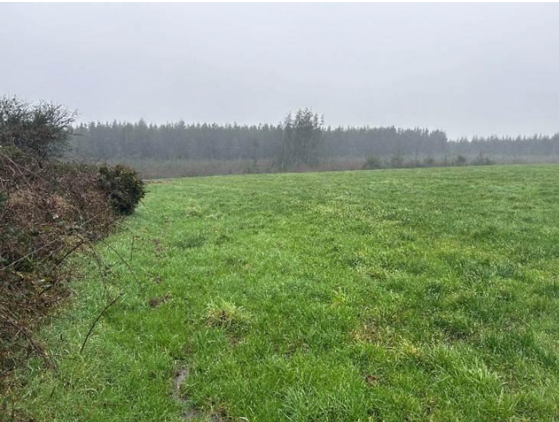
Plate 15-16 Turbine 9, facing west