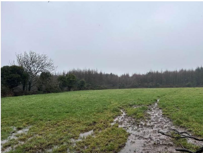
Plate 15-10 Turbine 8, facing northwest