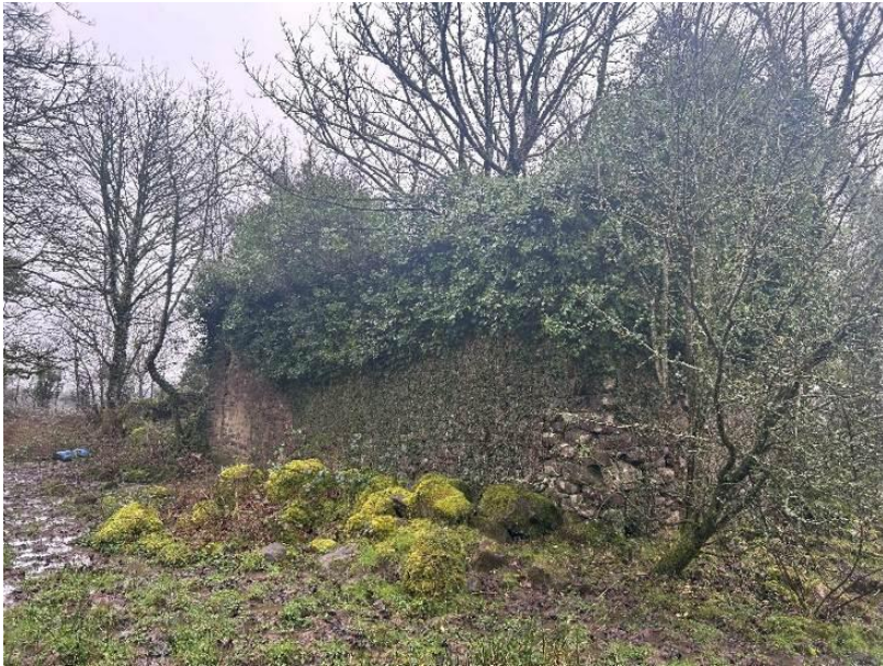
Plate 15-5 Vernacular house (CH01), facing northeast