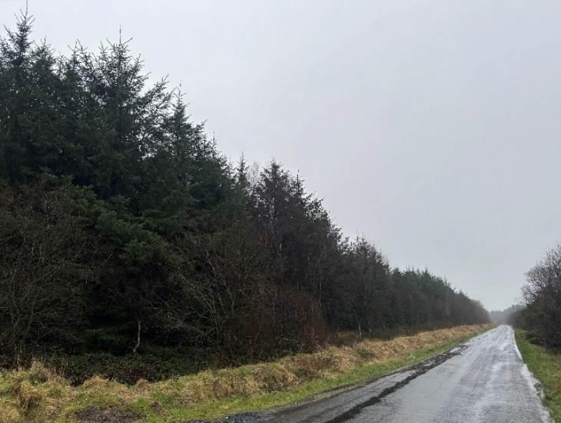
Plate 15-3 Site of Turbine 2, facing southeast