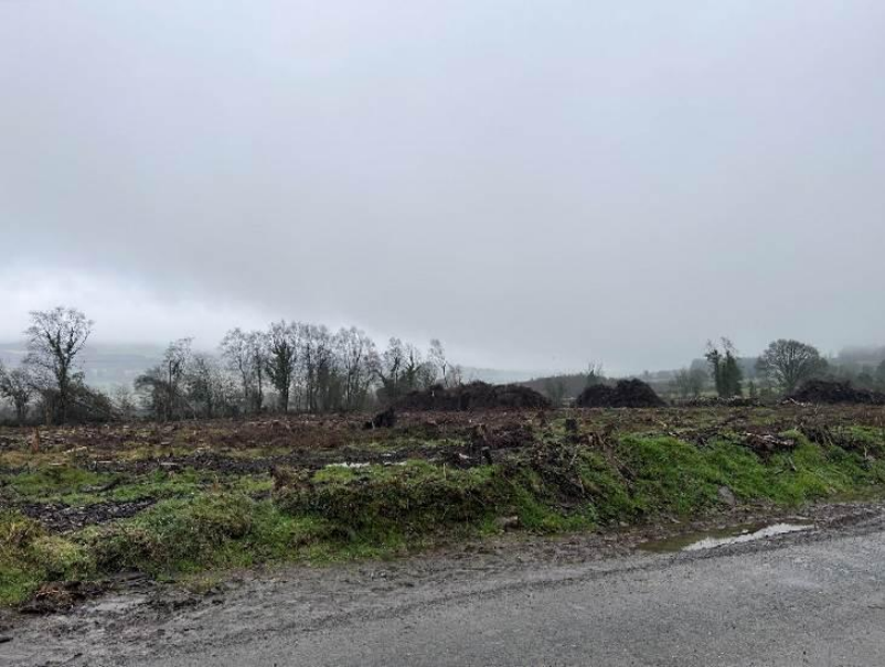
Plate 15-19 GCO One, facing east