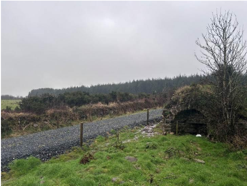
Plate 15-9 Setting of lime kiln (CH35), facing northeast