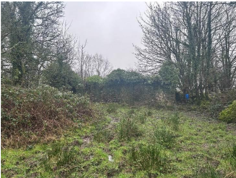
Plate 15-6 Outbuildings at CH01, facing south